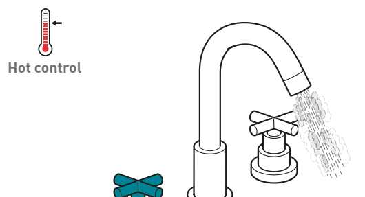
Turning the hot tap clockwise increases the flow of hot water