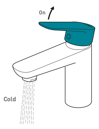
Moving the mixer lever upwards will increase the flow of cold water.