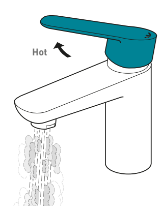
Moving the mixer lever to the left will increase the water temperature.