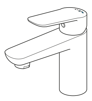
Lever in the Off position