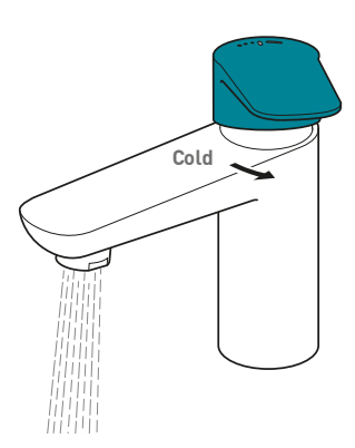
Moving the mixer lever to the right the water will stay cold.